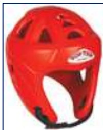
Avant-garde / Bio Flex