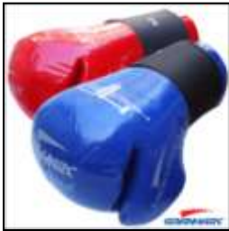
Glove Protector High Pro