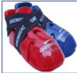
Kick Protector High Pro