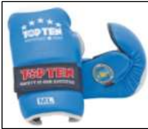
Open Hands SuperFight 3000