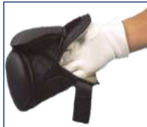
White Cotton – No support