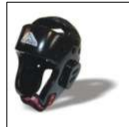
Top Pro Head Guard