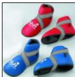
Complete Foot Protector