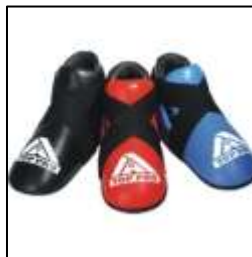
MAX Foot Protector