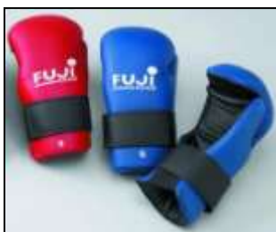
ITF Open Gloves