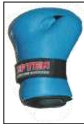
Open Hands Point Fighter