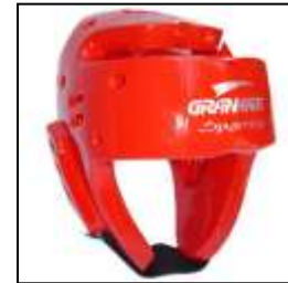
Open head Protector